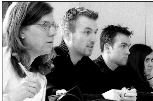
Students at The Bible Seminary, Bonn, Germany

At CWO we work in partnership with other like-minded Christian ministries. The Bible Training Centre for Pastors (Atlanta) provides the curriculum which CWO translates for use at international teaching sites.